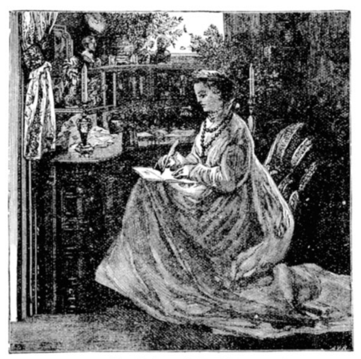
How the Journal was written