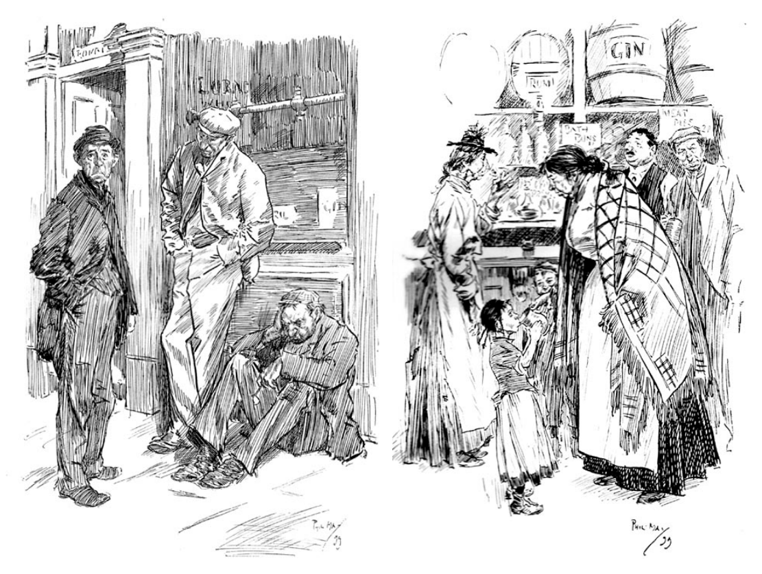
Two of Phil May's depictions of life in the East End: East End Loafers and A Street-Row in the East End.